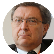
Enrico Giovannini, Full Professor and Director, Alleanza Italiana per lo Sviluppo Sostenibile

Thanks to your work, many more companies, associations, civil society organizations and people know what they didn't know: they are wasting a lot of food, energy, water and many other things.